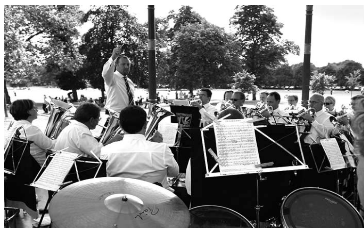
Band at Royal Greenwich Park

Our summer engagements are now drawing to a close. Our most memorable engagement was a trip to London to play at the Royal Greenwich Park Bandstand on Sunday 27 th July. The weather was glorious and the grounds crowded with families enjoying picnics, the sun and the music.