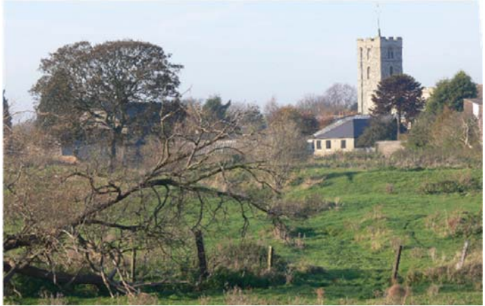
The site of the Abbey